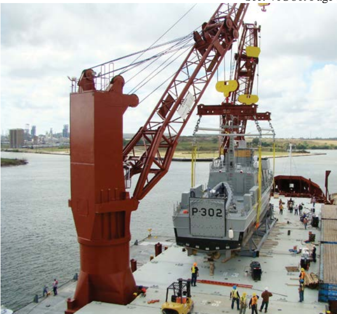
A 400 Ton Crane could lift the LCI onto a barge