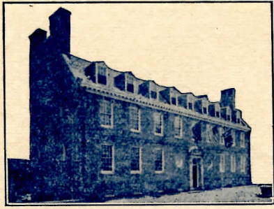
SEAMEN'S CHURCH INSTITUTE OF NEWPORT Market Square, Opp. Government Landing NEWPORT, R. I.

It is now the next morning. I'm waiting for the guy to come around with the papers so I can see the scores.